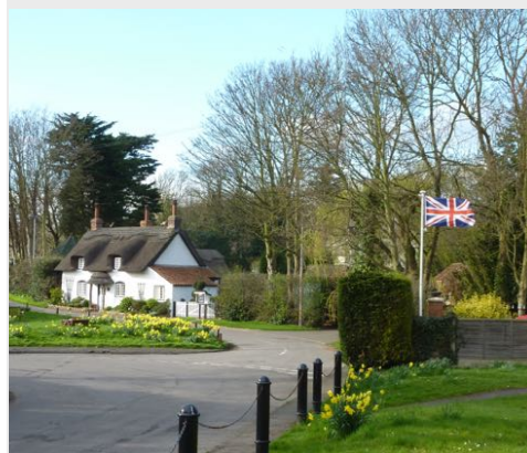
Early spring bursting into bloom Appleby

We have a number of Street Coordinators details of which can be found on the Parish Council web page www.applebypc.org.uk and the village website www.appleby-lincs.co.uk