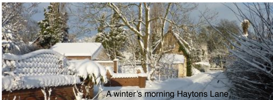
A winter's morning Haytons Lane

In the meantime, please remain alert to possible opportunist criminals. Keep in touch regularly with your near neighbours and keep our local police and NhW informed of anything which may become a safety or security risk.