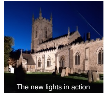
The new lights in action

It has been a strange year and we have been unable to do any real fundraising events due to the virus. We have however managed to raise funds for the new lights for the church. Thanks to all in the village who gave money to get the new lights. Over £1,000 was raised very quickly and they have already been fitted, lighting up the church beautifully through these long winter nights. Thanks also to Stuart Cavanagh who fitted the new lighting system.