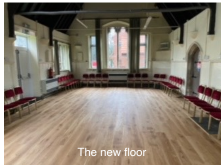
The new floor

Firstly the buildings health remains our top priority, especially whilst not in 'full' use, and thanks to a generous donation and utilising the governments COVID grant we received, we have not only maintained our robust practices but also invested in the priority areas identified in the building survey conducted last year. This includes addressing plumbing issues, treating and replacing the flooring in the main hall, fixing minor subsidence damage and addressing some damp issues, including adding guttering and decorating and installing a new ventilation system in the kitchen. However, there is still more work to complete and we are looking at grants for this but in these strange times and due to the high costs forecast, this remains a challenge. Continuing to manage our costs closely and using our limited funds wisely in terms of maintenance etc will be essential as we enter this coming year.