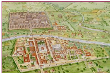
Eboracum (York) as it was under Roman occupation .

The story now turns to the Normans or Northmen who were originally pagan pirates making raids on coastlands. They settled in Northern France, founded the Duchy of Normandy and set out to conquer and colonise England, Wales, Scotland, Ireland, Southern Italy and Sicily.